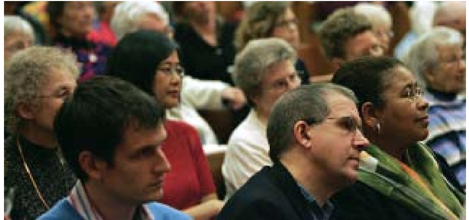
In January, more than 400 residents attended a town hall meeting about the future of the Cedar Rapids Public Library. Elected officials, library board members, and library patrons addressed the capacity crowd.

The Foundation exists to enhance our library, supporting capital