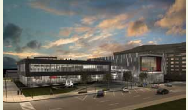
Artist's rendering of the new Cedar Rapids Public Library: Models suggest that this new 95,000 square-foot library will require only 30% of the annual energy costs required by the 85,000 square-foot flooded facility.

T HE EVENT THAT CHANGED EVERYTHING in our community – the 2008 flood – was also the inspiration for a major transformation at the Cedar Rapids Public Library Foundation. Always dedicated to enhancing and improving services at the library, the Foundation is now in a position to do much more – helping to rebuild a state-of-the-art library that will serve our community for decades to come. Stepping up to meet this challenge in 2011, the Foundation launched the $8 million Library 3.0 Campaign to provide vital private funding for the new library project. In the process, the Foundation's Board of Directors has redefined itself, creating a blueprint that will carry the Foundation forcefully into the future as a reliable and growing funding source for a treasured and essential community institution.