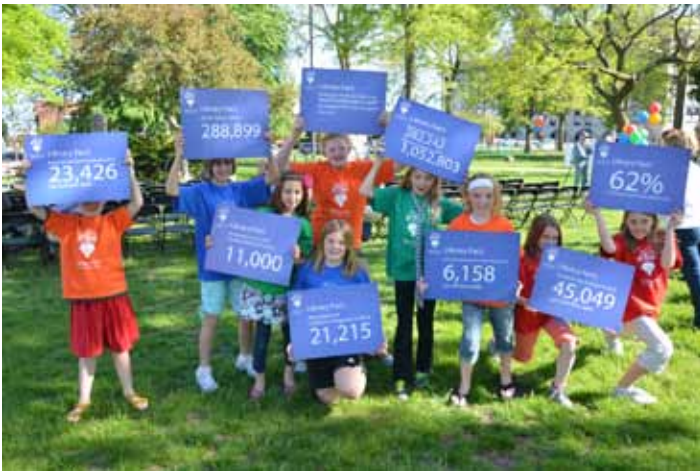
Young library fans shared impressive library facts with the crowd at the Library 3.0 Campaign kickoff event in May 2011.