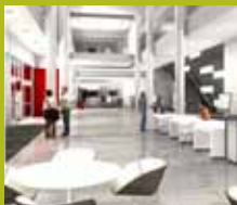
New Library Project: $743