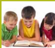
Children's & Young Adult Services: $561