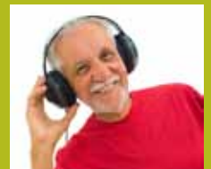
Downloadable Audio: $24,638

While the Library 3.0 Campaign is the current focus, the Foundation continues to collect gifts from donors who designate their gifts in support of new book purchases and children's services. Unrestricted gifts are invested so that the Foundation can continue to provide funds for special library projects. The Foundation also covers 100 percent of costs associated with the library's audio book service.