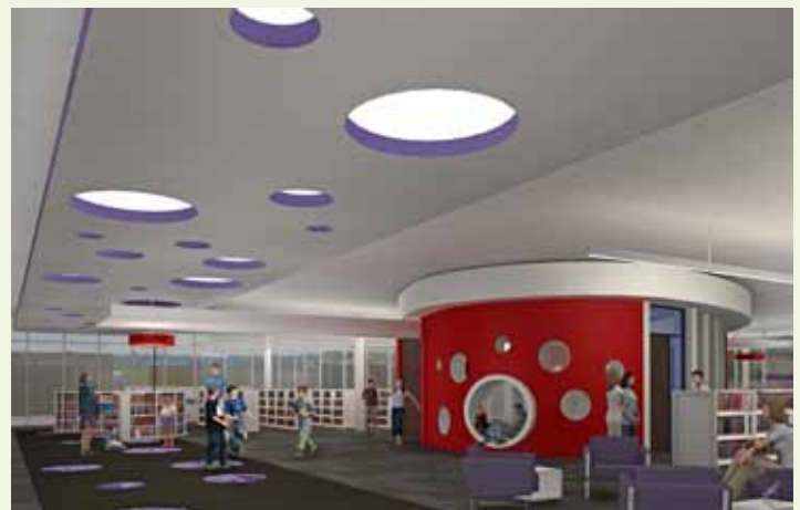
The new library will include a colorful, interactive children's space that is nearly double the size of the previous one.