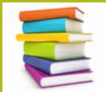
Books & Materials: $838