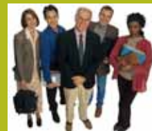
Staff Training & Appreciation: $1,408